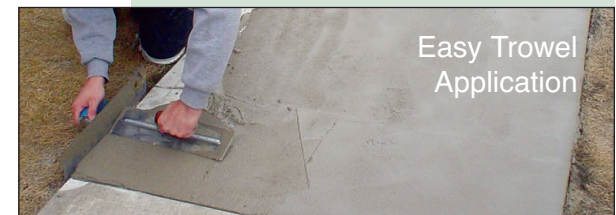
Easy Trowel Application